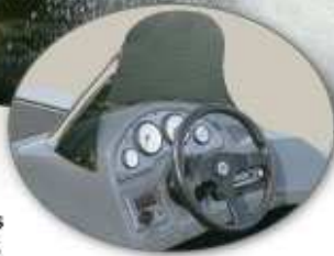
Molded Console Features Tilt Steering Wheel