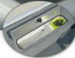
45° Port Side Livewell With Bait Separator

Sporting a smaller version of the high performance hull of the Stealth 178, our Stealth 169C offers all the benefits and features of our deep-vee design in a more economical package.